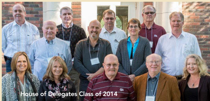
House of Delegates Class of 2014

Are you passionate about the University of Montana and looking for ways to get involved? Select the "About Us" tab on www.grizalum.com for more information and to fill out the nomination/application form.